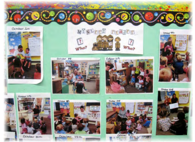
Who will our Mystery Reader be today?