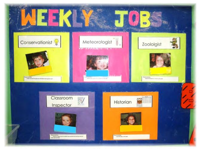
We are taking responsibility for our classroom.