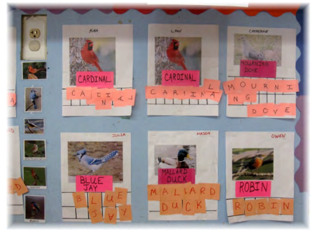
We're identifying birds and letters.