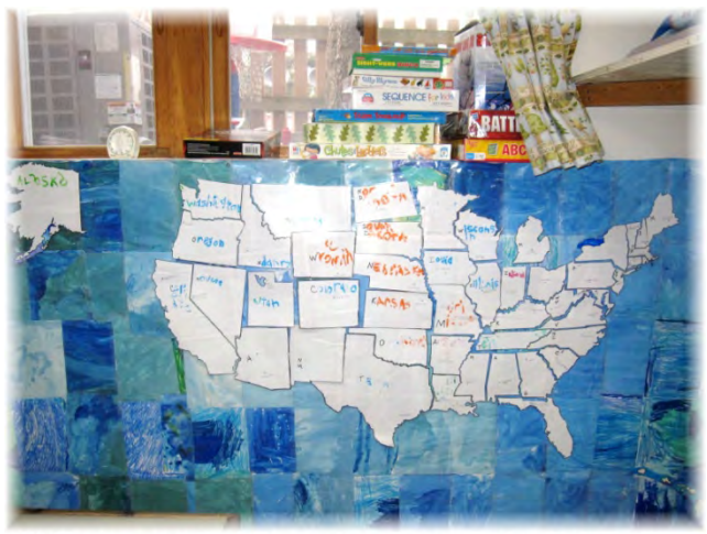
Where do we live? Learning about the United States.