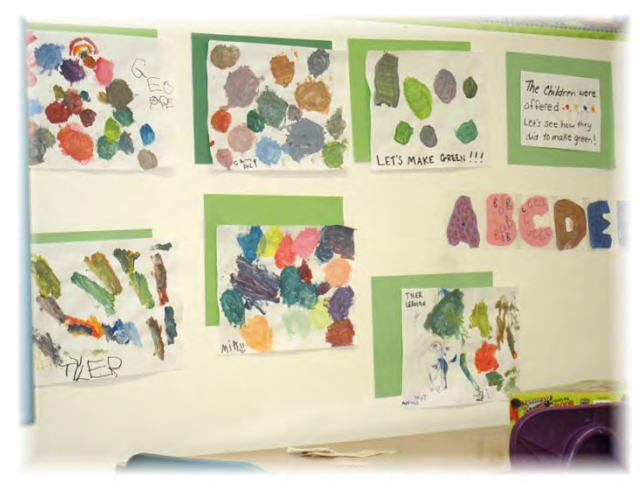
Color mixing - Let's make green!

Every day, in every classroom, we are learning so much that doesn't fit neatly on a take-home worksheet. Check out these bulletin boards that show the variety and depth of the activities that engage our children in art, science, language, and math.