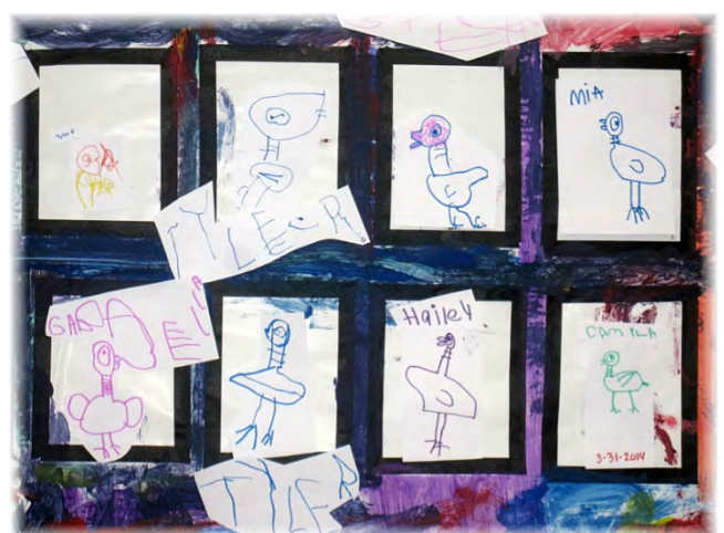
Using the elements of art to draw a picture and write our names.