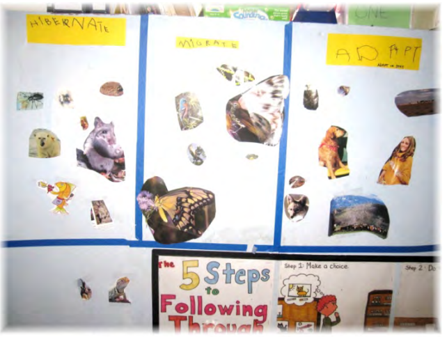
How do animals survive in winter?