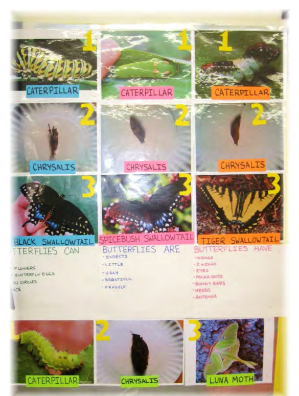
We're learning about the butterfly cycle.