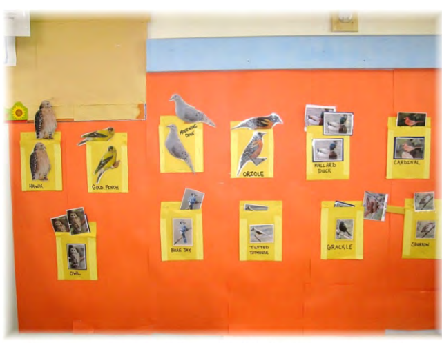
We are learning to identify birds we see every day.