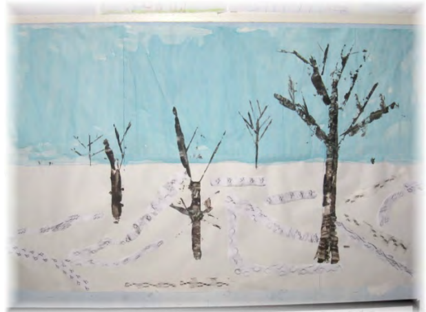
We saw animal tracks in winter snow and learned about animals who made them.